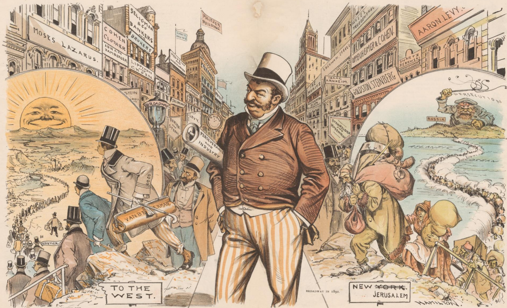
THEIR NEW JERUSALEM.

The Jewish population of New York last February was from 225,000 to 250,000, and this total will be increased by immigration during the rest of the last year by from 45,000 to 50,000. Instead of returning to the holy land to build up Jerusalem and to restore the glories of their race, the chosen people are coming to the metropolis of the new world. Of the twelve hundred wholesale firms occupying the buildings on Broadway from Canal street to Union square, it is estimated that one thousand are Jews. The aggregate of the capital controlled by 4,000 Jewish merchants in New York is estimated at $50,000,000. Their holdings of real estate in the town are estimated at from $50,000,000 to $100,000,000.